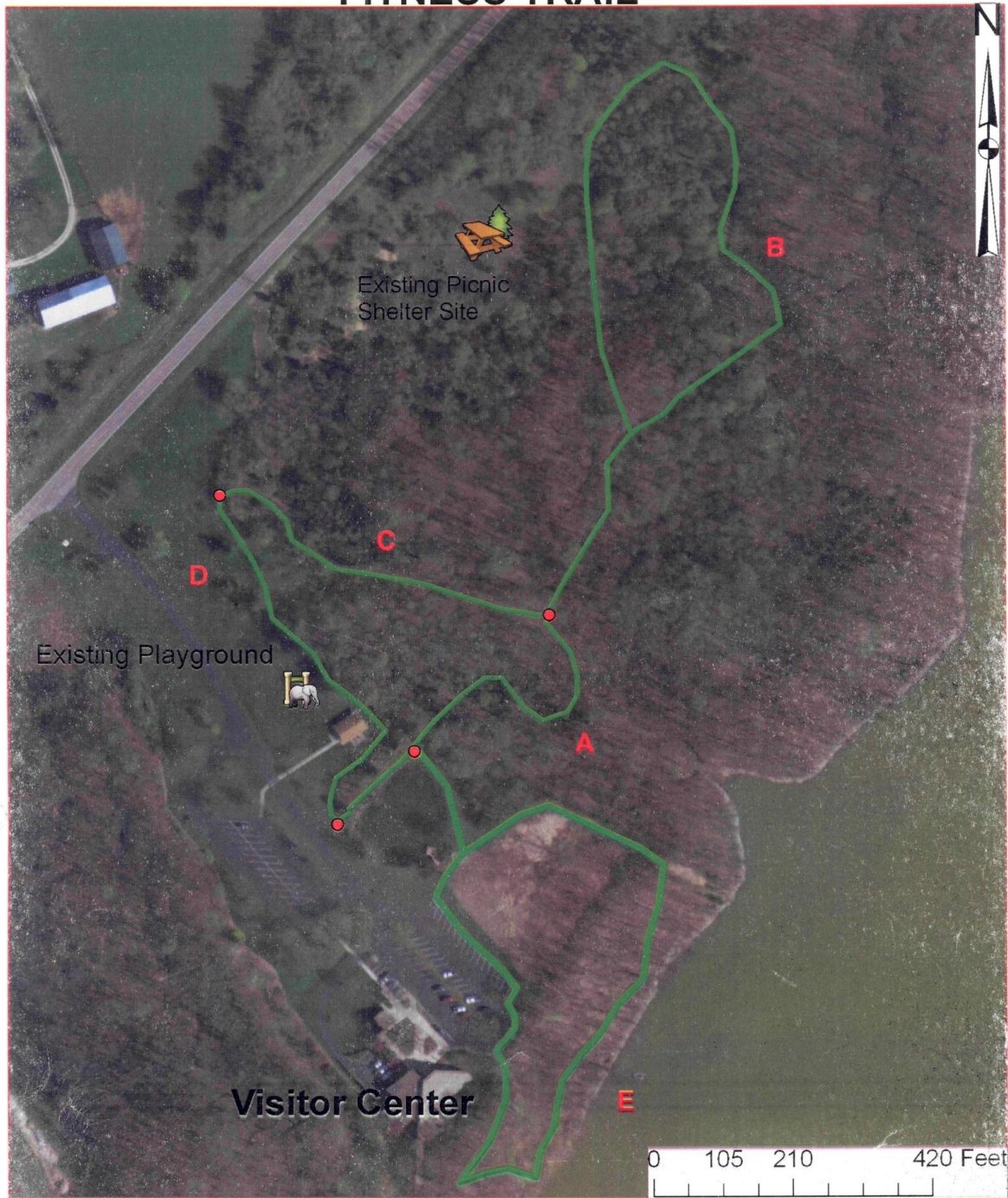
Proposed Layout of the One Mile Fitness Trail to be located at the Visitor Center Recreation Area at Caesar Creek Lake.